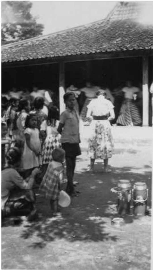
Dance classes in the Kraton