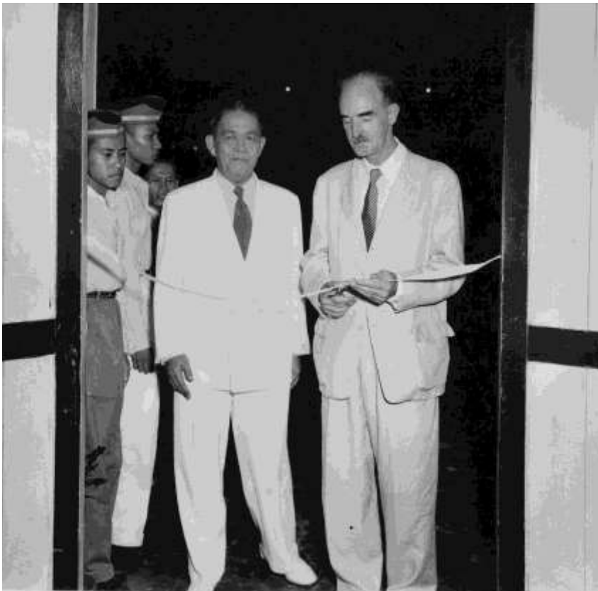
From R: Dr Johannes Leimena (Health), Ir Djuanda (Communications), JSR

ICAO sent 20 instructors in 1951-2, 40% of UN aid budget. JSR & Djuanda (Communications Minister, & chair of Coordinating Committee for Foreign Aid) open Civil Aviation Display, 1952