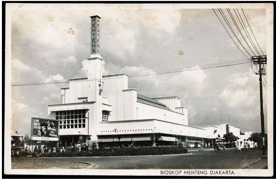
BIOSKOP MENTENG DJAKARTA.