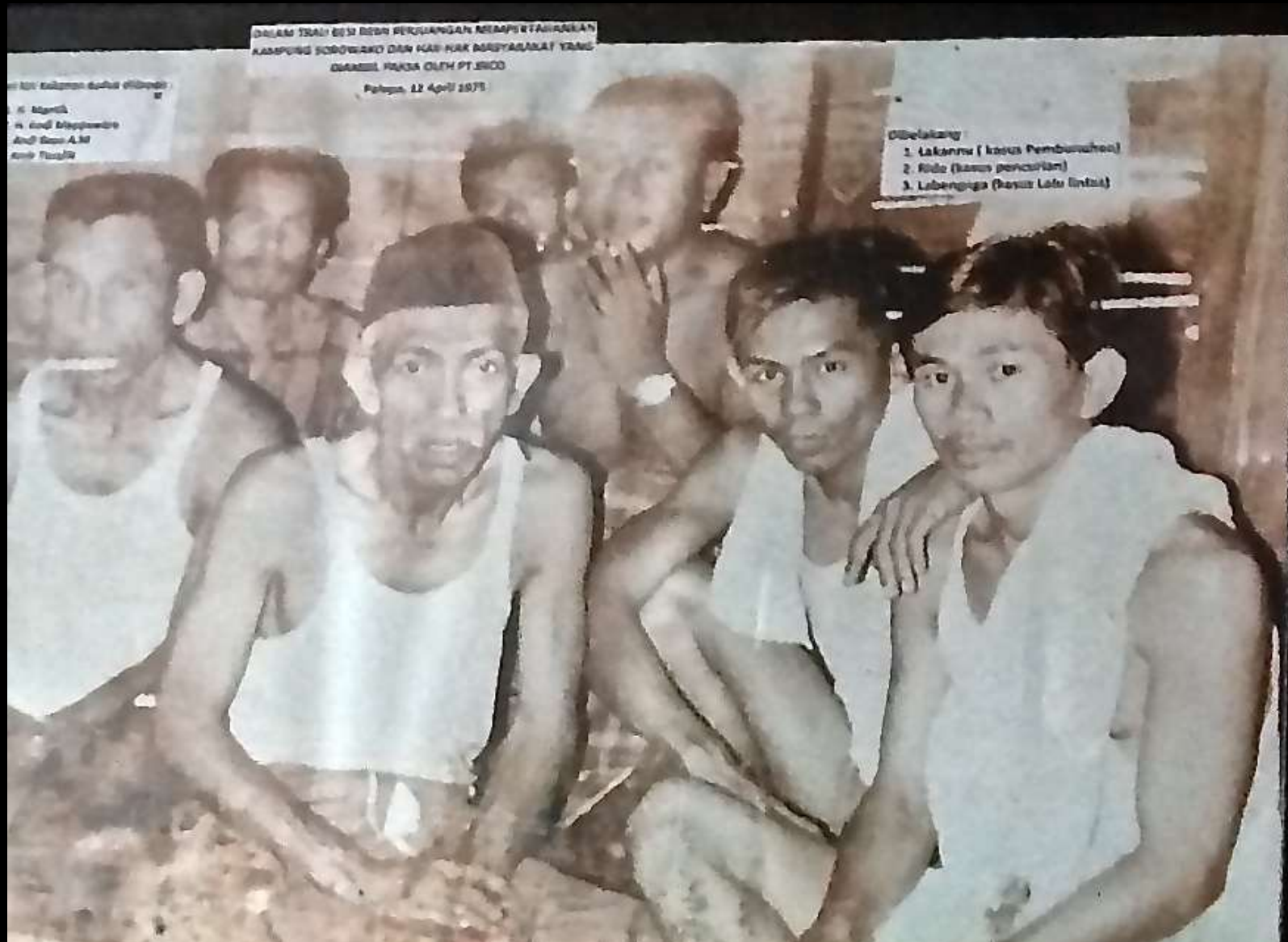
Panitia Pembebasan Tanah – In jail Palopo 1972