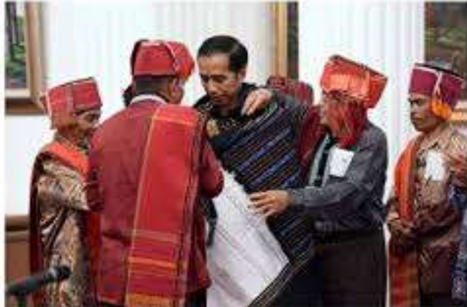
Presiden Jokowi bersama masyarakat hukum adat, Jumat (30/12) pagi, di Istana Negara, Jakarta.