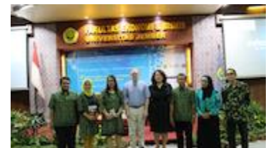
BIES Economic Dialogue and Forum