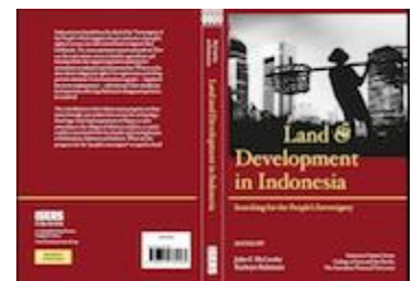
Update book launches in Canberra and Sydney