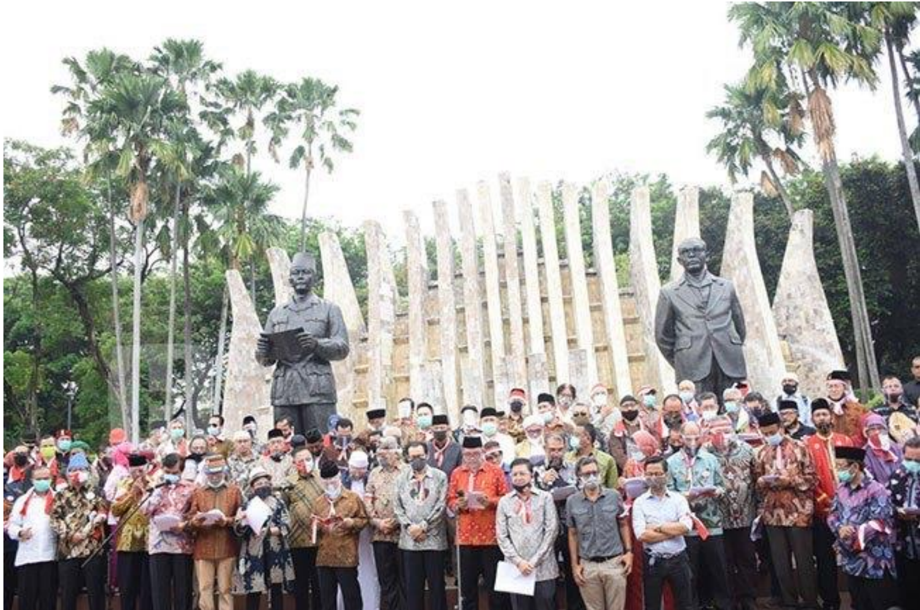
KAMI launch in Jakarta