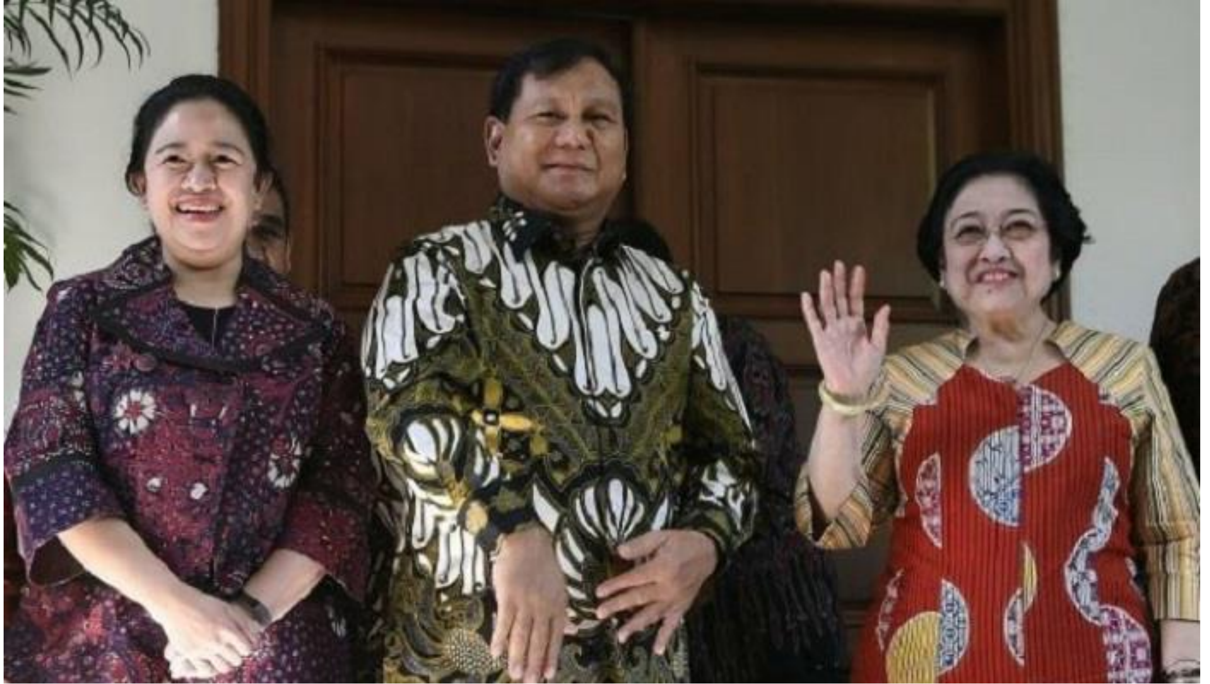
Puan Maharani, Prabowo Subianto and Megawati Sukarnoputri