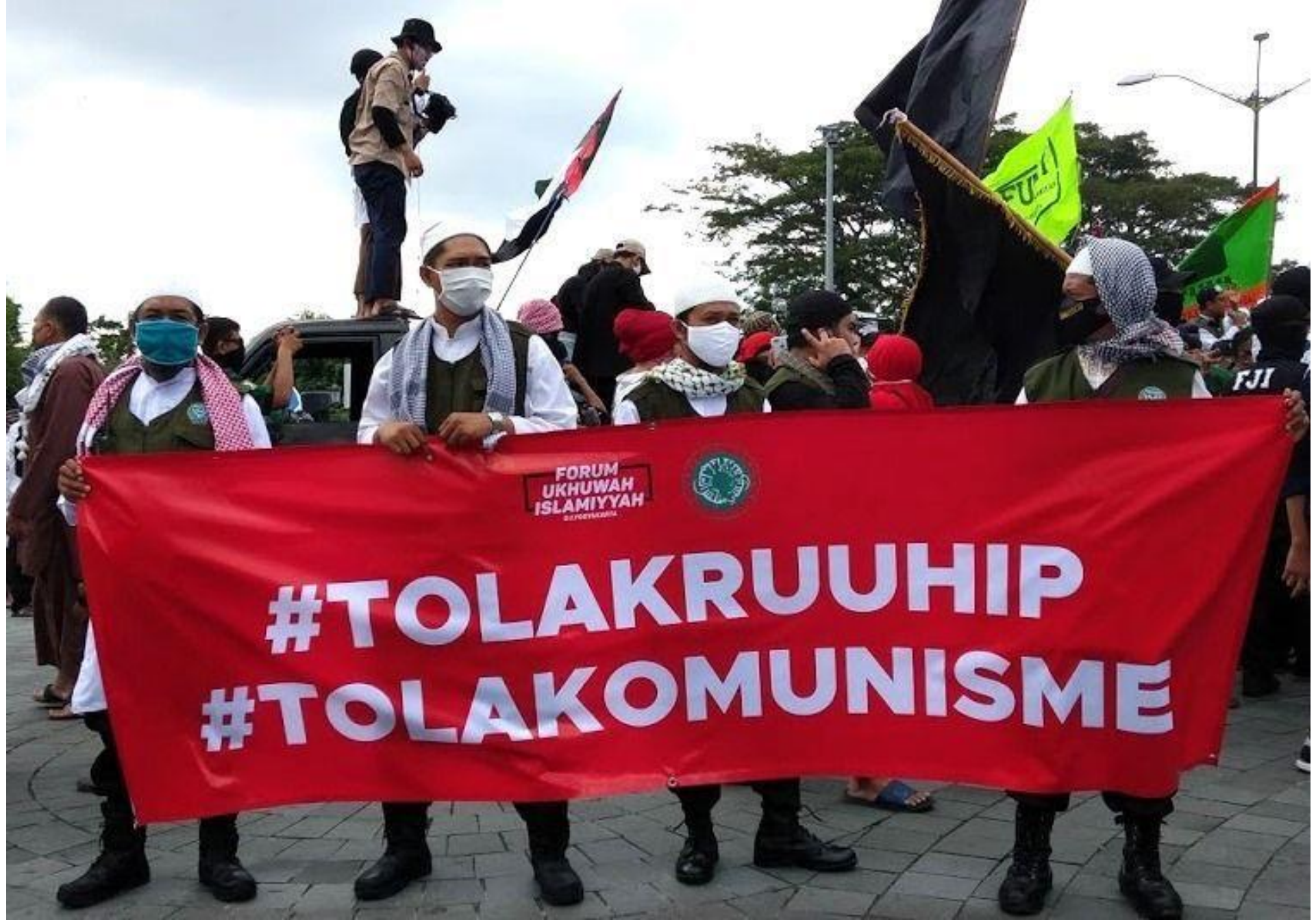
'Reject the HIP Bill; Reject Communism' banner