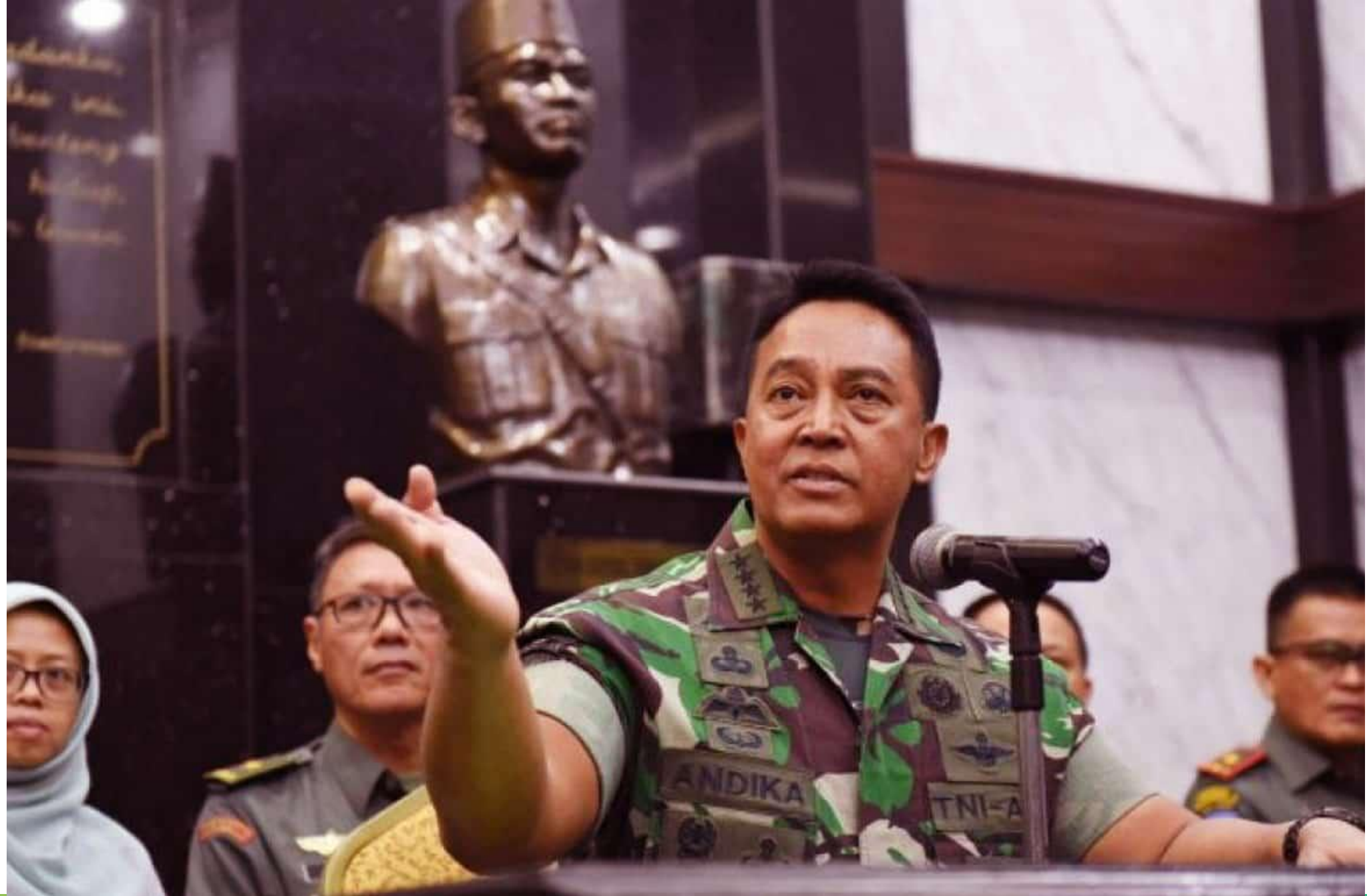
General Andika Perkasa