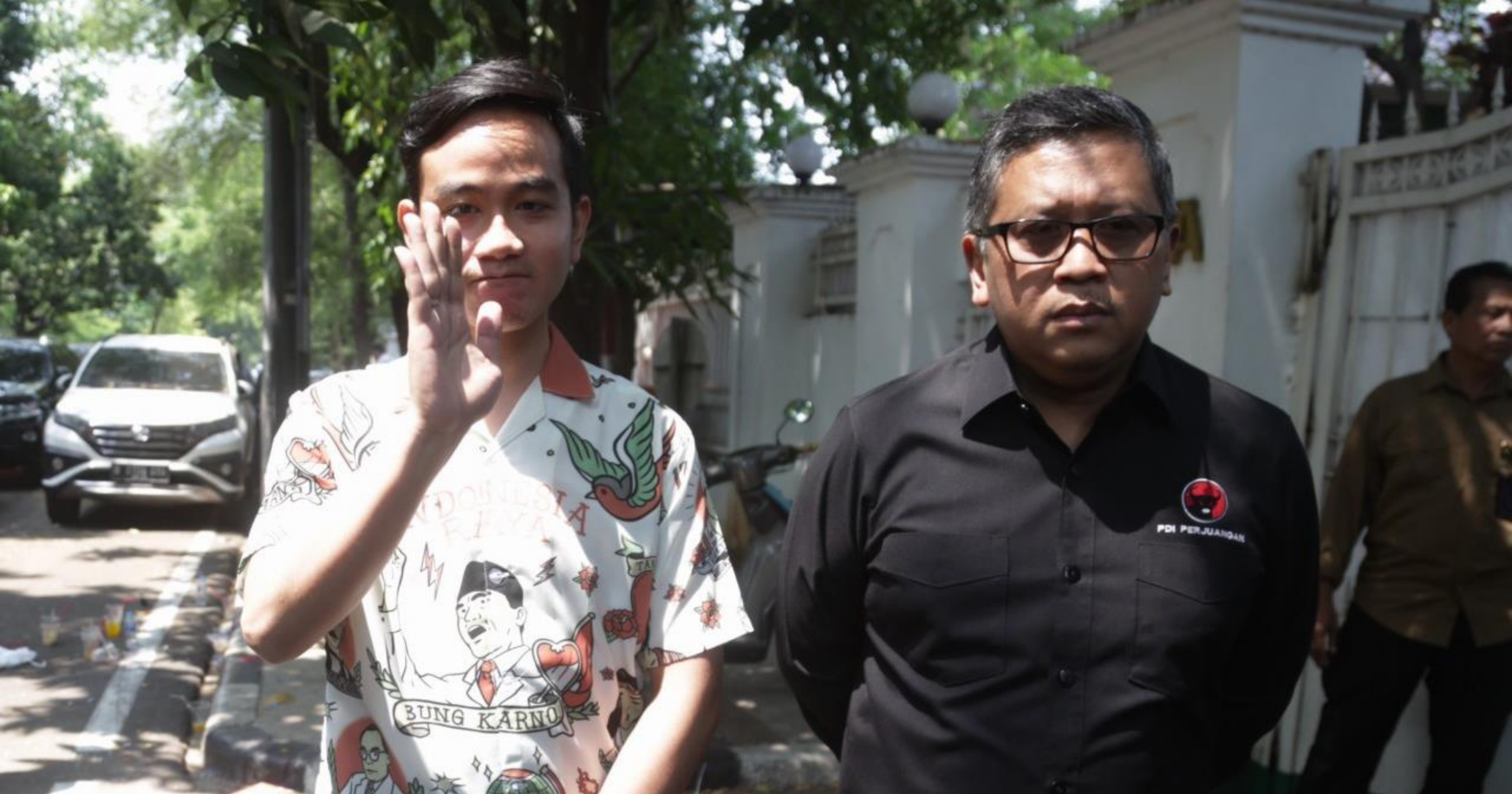
Gibran Rakabuming Raka and Hasto Kristiyanto calling on Megawati