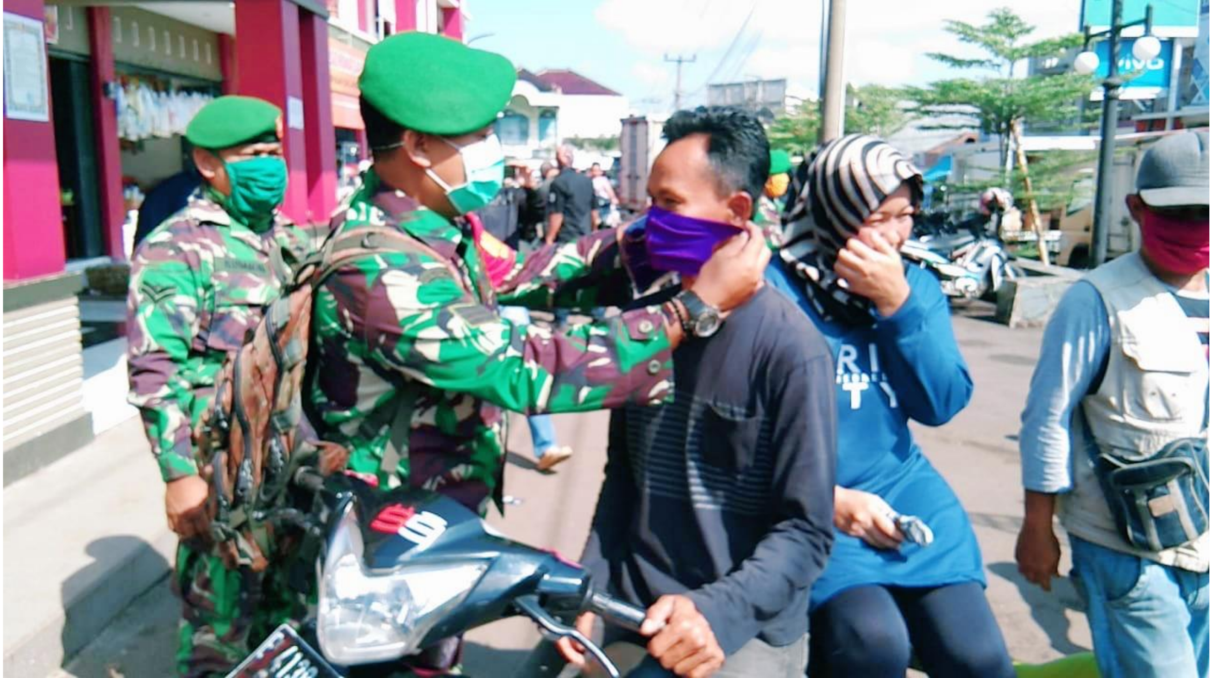
Soldiers policing mask-wearing regulations