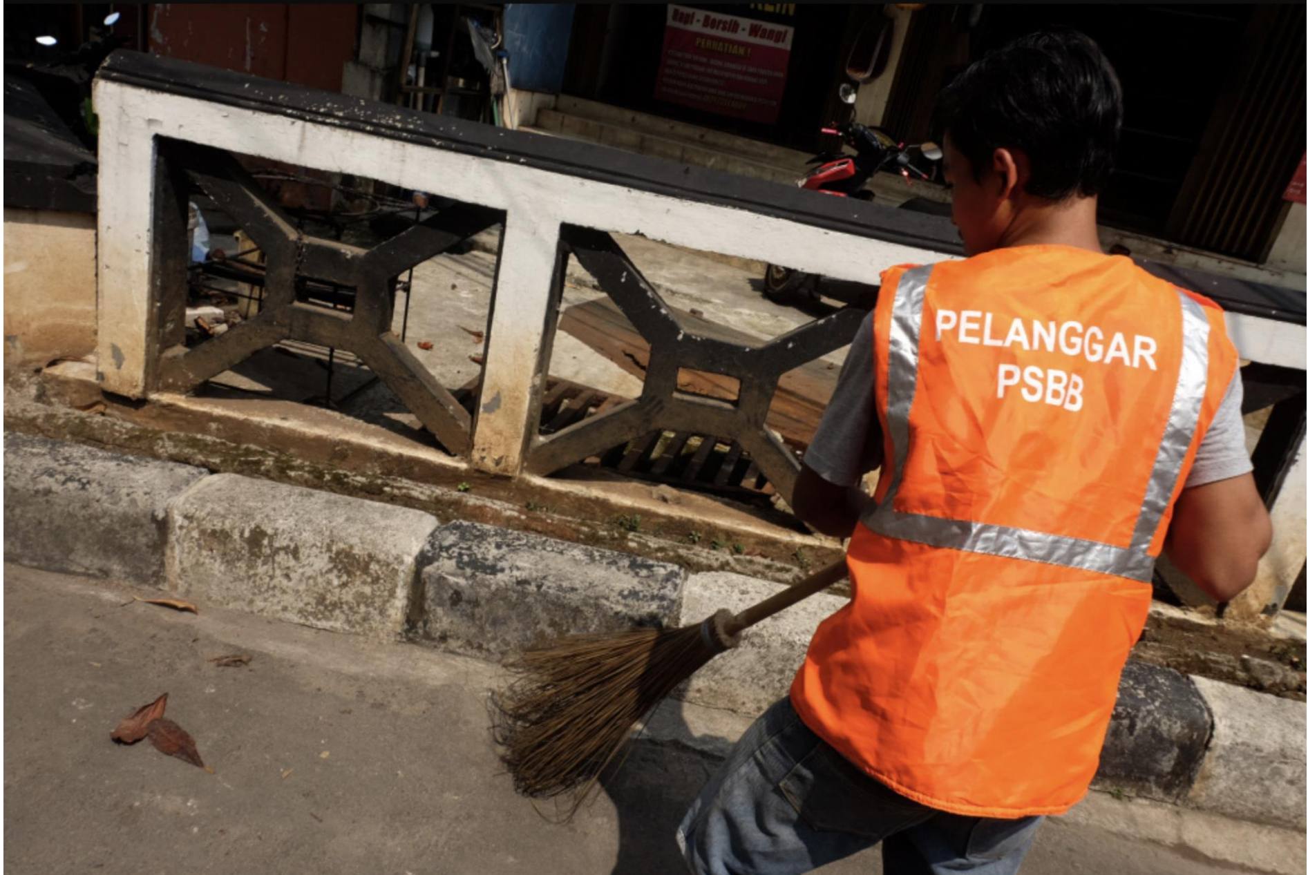
Man sweeping gutters after breaching Covid restrictions