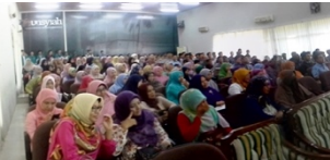
2016 FKP Roadshow