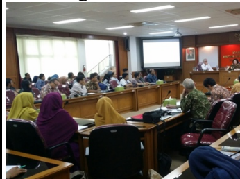
Eminent people talk the walk in UGM