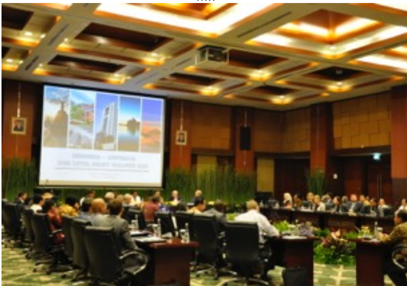
The Indonesia – Australia High Level Policy Dialogue 2016 was held on 7 March at the Ministry of Finance in Jakarta.